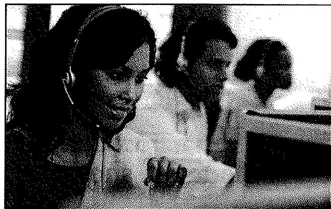
National Careers Service advisers provide tailored information

● To find out more about how the National Careers Service can help you, visit